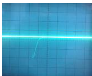
Effects of impulse noise